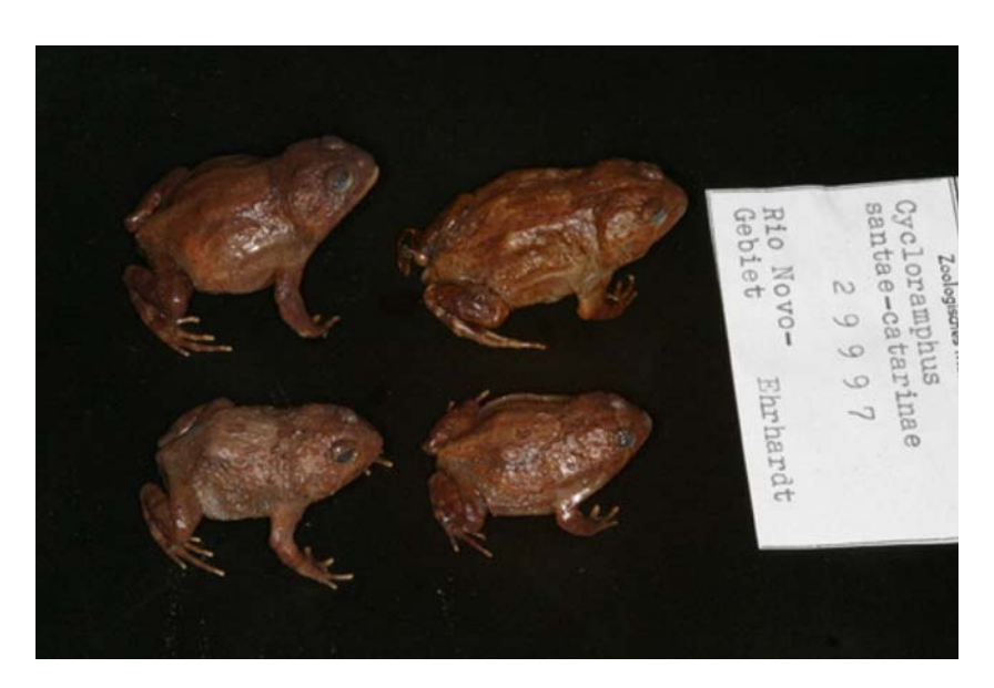
Figure 3. Historical material of C. bolitoglossus in the ZMB collection, collected near Corupá (Rio Novo, Santa Catarina, Brazil) by Wilhelm Ehrhardt.