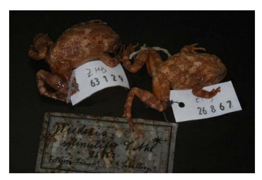
Figure 8. Two rediscovered syntypes (ZMB 26867 and 63129) of Niedenia spinulifer (= C. asper ) in the ZMB collection (locality restricted to "surely southern Brazil" by Bokermann (1966)).