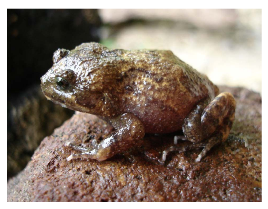
Figure 1. Female of Cycloramphus bolitoglossus in life, from Parque Nacional da Serra de Itajaí, Santa Catarina, Brazil (MCP 8725, 39.5mm).

Additional material of C. bolitoglossus was found recently in the herpetological collections of three natural history museums in Germany (Fig. 3). These historical specimens, which were in excellent conditions but partly misidentified and not yet inventoried, have been collected between 1918 and 1928 in the surroundings of Corupá (river basin of Rio Humboldt and Rio Novo) in northern Santa Catarina by the German collector Wilhelm Ehrhardt. This material comprised following specimens: ZMB 29997, 68240, 68184-186 (five specimens, see Gutsche et al. 2007a); ZMH A01745, A08793-95, A08796-8800, A08901 (ten specimens, see Gutsche et al. 2007b); and ZSM 103/1988 (two juvenile specimens). It is to remark that, in the ZSM collection,