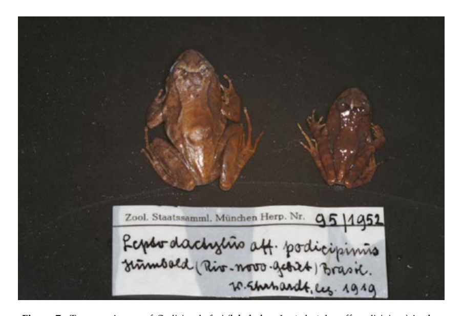
Figure 7. Two specimens of C. diringshofeni (labeled as Leptodactylus aff. podicipinus ) in the ZSM collection, collected near Corupá (Rio Novo, Santa Catarina, Brazil) by W. Ehrhardt.

differences to specimens of C. asper we examined. During our studies in the ZMB collection we rediscovered two type specimens of C. asper which were considered "probably destroyed" according to Heyer (1983a) or "possibly lost" according to Frost (2007). These syntypes (two specimens without numbers according to Heyer 1983a) of Niedenia spinulifer Ahl, 1924 (a synonym of C. asper) are inventoried under ZMB 26867 and 63129 (Fig. 8). According to the label the locality is given as "?Ndjiri-Sümpfe? ?Schillings?" (meaning Ndjiri swamps, Schillings?), but the type locality of this species was regarded "surely southern Brazil" by Bokermann (1966).