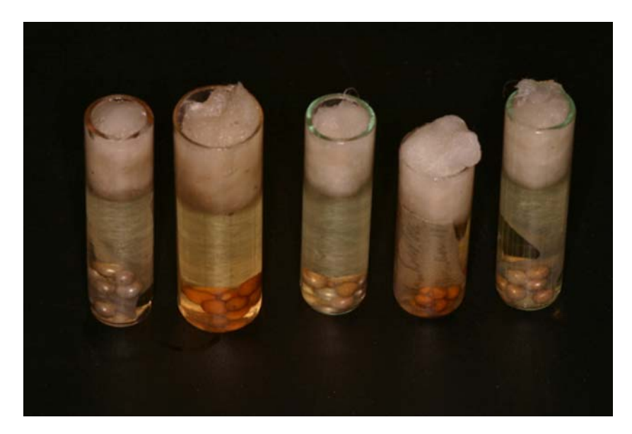
Figure 4. Five lots containing large eggs attributed to C. bolitoglossus by W. Ehrhardt, but possibly belonging to the genus Ischnocnema (lots are within the jars of specimens ZMH A08796–8800 and A08901).