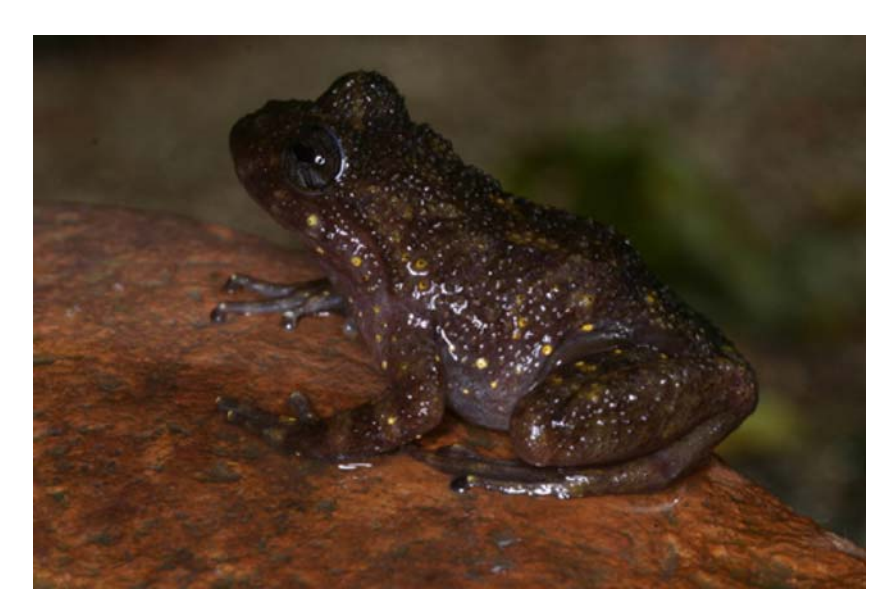
Figure 5. Male of C. izecksohni in life from the surroundings of Corupá (Santa Catarina, Brazil).