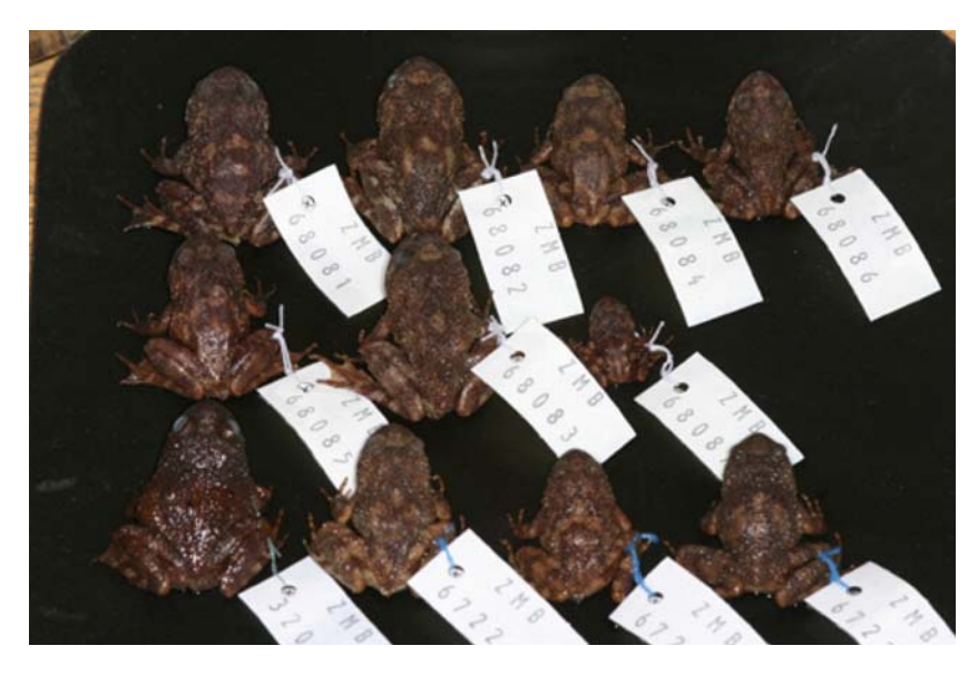
Figure 6. Historical material of C. izecksohni in the ZMB collection, collected near Corupá (Rio Novo, Santa Catarina, Brazil) by W. Ehrhardt.